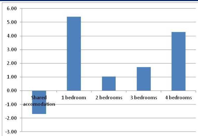
Figure 1: Change in weekly LHA costs

While the average Housing Benefit award fell by 0.05%, the average weekly LHA award did so by 0.9% but by multiplying the number of claimants by average weekly award an overall weekly LHA cost increase of 1.8% (£2,862) can be estimated. Figure 1 shows how average costs have changed over this period by dwelling size.