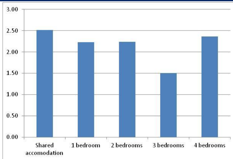
Figure 1: Change in weekly LHA costs

While the average Housing Benefit award grew by 0.6%, the average weekly LHA award grew by 0.8% and by multiplying the number of claimants by average weekly award an overall weekly LHA cost increase of 2.9% (£9,100) can be estimated. Figure 1 shows how average costs have changed over this period by dwelling size.