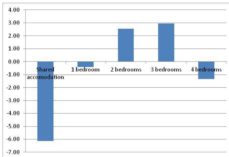
Figure 1: Change in weekly LHA costs

While the average Housing Benefit award grew by 0.4%, the average weekly LHA award fell by 0.9% and by multiplying the number of claimants by average weekly award an overall weekly LHA cost decrease of 0.2% (£177) can be estimated. Figure 1 shows how average costs have changed over this period by dwelling size.