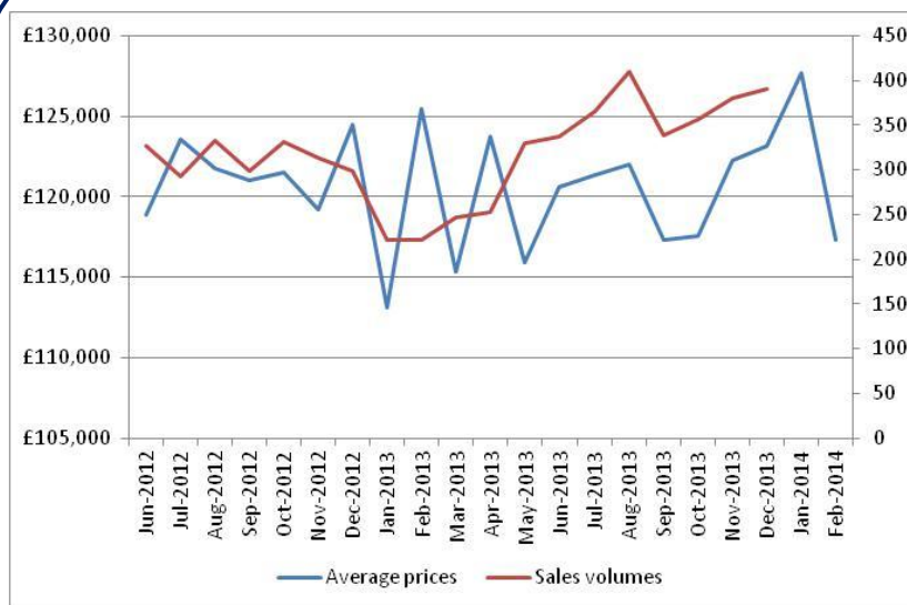
Figure 2: Change in house prices and sales volumes

In 2012/13, Northumberland Council made a total of 593 homeless decisions. Of these, 227 applicants were accepted as being homeless and in priority need (38.3%). The number accepted as being homeless equates to 1.62 per 1,000 households in the borough – down from 1.68 in 2011/12 and up from 1.39 in 2010/11.