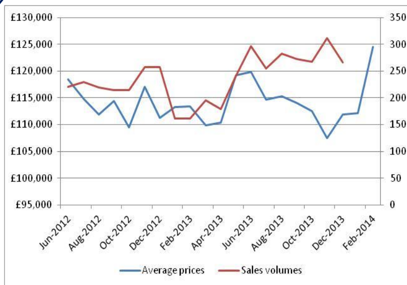
Figure 2: Change in house prices and sales volumes

In 2012/13, Newcastle Council made a total of 1,396 homeless decisions. Of these, 220 applicants were accepted as being homeless and in priority need (15.8%). The number accepted as being homeless equates to 1.77 per 1,000 households in the city – up from 1.71 in 2011/12 but down 1.94 in 2010/11.