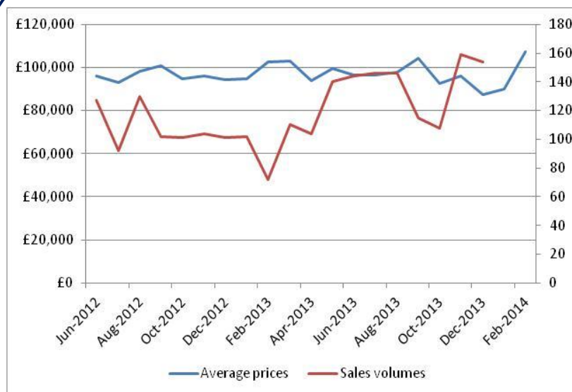
Figure 2: Change in house prices and sales volumes

In 2012/13, South Tyneside Council made a total of 429 homeless decisions. Of these, 295 applicants were accepted as being homeless and in priority need (68.8%). The number accepted as being homeless equates to 4.28 per 1,000 households in the district – down from 5.19 in 2011/12 but up 3.47 in 2010/11.