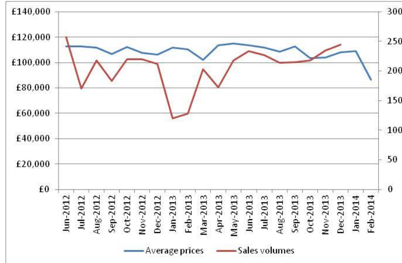
Figure 2: Change in house prices and sales volumes

In 2012/13, Stockton on Tees Council made a total of 179 homeless decisions. Of these, 47 applicants were accepted as being homeless and in priority need (26.3%). The number accepted as being homeless equates to 0.57 per 1,000 households in the district – down from 1.08 in 2011/12 and from 0.84 in 2010/11.