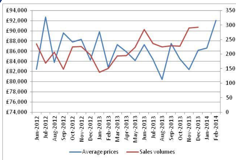
Figure 2: Change in house prices and sales volumes

In 2012/13, Sunderland Council made a total of 306 homeless decisions. Of these, 125 applicants were accepted as being homeless and in priority need (40.8%). The number accepted as being homeless equates to 1.02 per 1,000 households in the district – up from 0.68 in 2011/12 but down 1.39 in 2010/11.