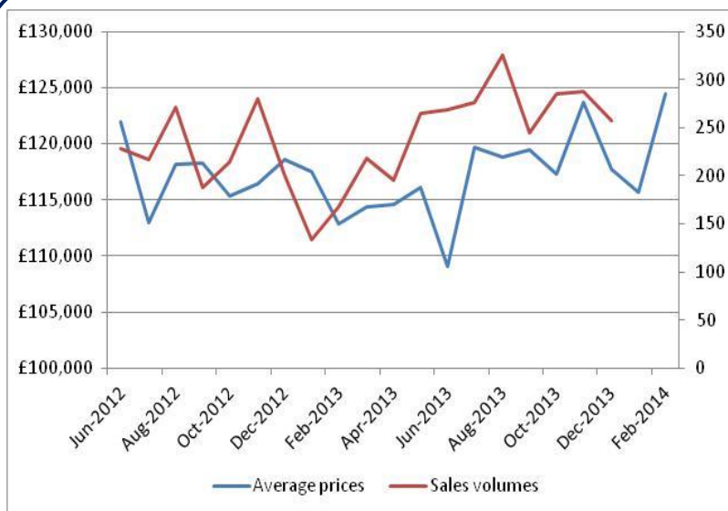
Figure 2: Change in house prices and sales volumes

In 2012/13, North Tyneside Council made a total of 346 homeless decisions. Of these, 168 applicants were accepted as being homeless and in priority need (48.6%). The number accepted as being homeless equates to 1.83 per 1,000 households in the district – up from 1.44 in 2011/12 but down 2.46 in 2010/11.