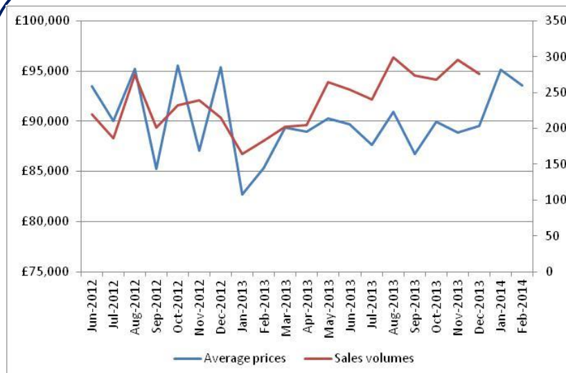
Figure 2: Change in house prices and sales volumes

In 2012/13, Bolton Council made a total of 570 homeless decisions. Of these, 284 applicants were accepted as being homeless and in priority need (49.8%). The number accepted as being homeless equates to 2.49 per 1,000 households in the borough – a similar level as in 2011/12 and up from 2.40 in 2010/11.