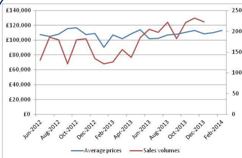
Figure 2: Change in house prices and sales volumes

In 2012/13, Bury Council made a total of 377 homeless decisions. Of these, 153 applicants were accepted as being homeless and in priority need (40.1%). The number accepted as being homeless equates to 1.96 per 1,000 households in the borough – down from 2.16 in 2011/12 but up from 1.51 in 2010/11.