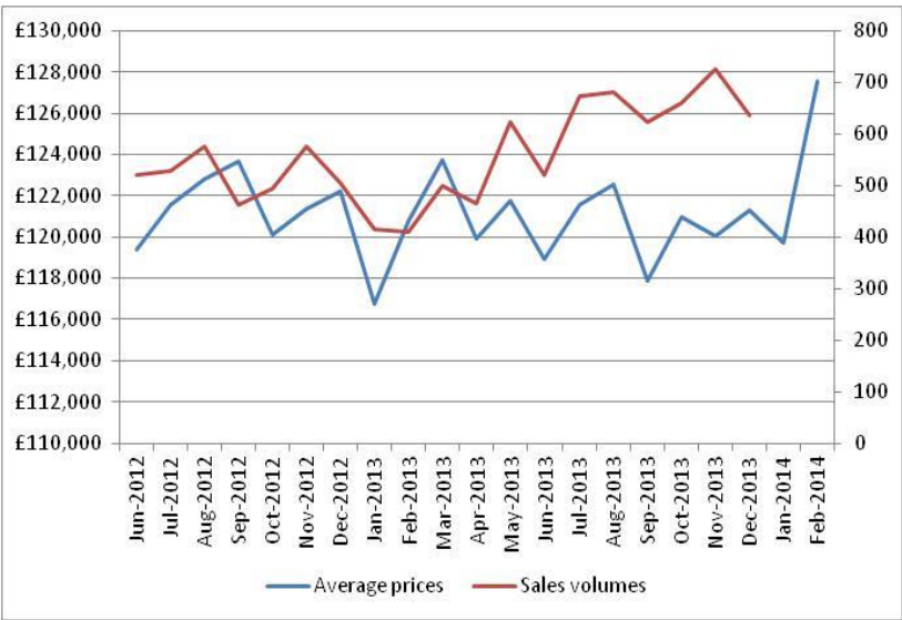
Figure 2: Change in house prices and sales volumes

In 2012/13, Carlisle Council made a total of 246 homeless decisions. Of these, 77 applicants were accepted as being homeless and in priority need (31.3%). The number accepted as being homeless equates to 1.57 per 1,000 households in the city – down from 3.55 in 2011/12 and 2.85 in 2010/11.