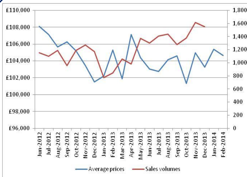
Figure 2: Change in house prices and sales volumes

In 2012/13, Chorley Council made a total of 81 homeless decisions. Of these, 22 applicants were accepted as being homeless and in priority need (27.2%). The number accepted as being homeless equates to 0.48 per 1,000 households in the borough – down from 0.84 in 2011/12 but up from 0.14 in 2010/11.