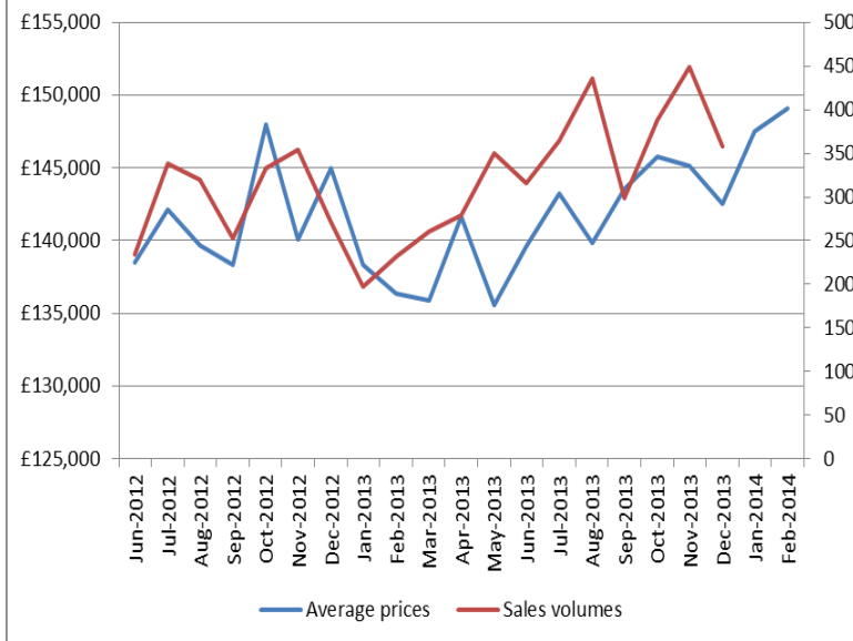
Figure 2: Change in house prices and sales volumes

In 2012/13, Stockport Council made a total of 457 homeless decisions. Of these, 134 applicants were accepted as being homeless and in priority need (29.3%). The number accepted as being homeless equates to 1.06 per 1,000 households in the borough – up from 0.76 in 2011/12 and from 0.92 in 2010/11.