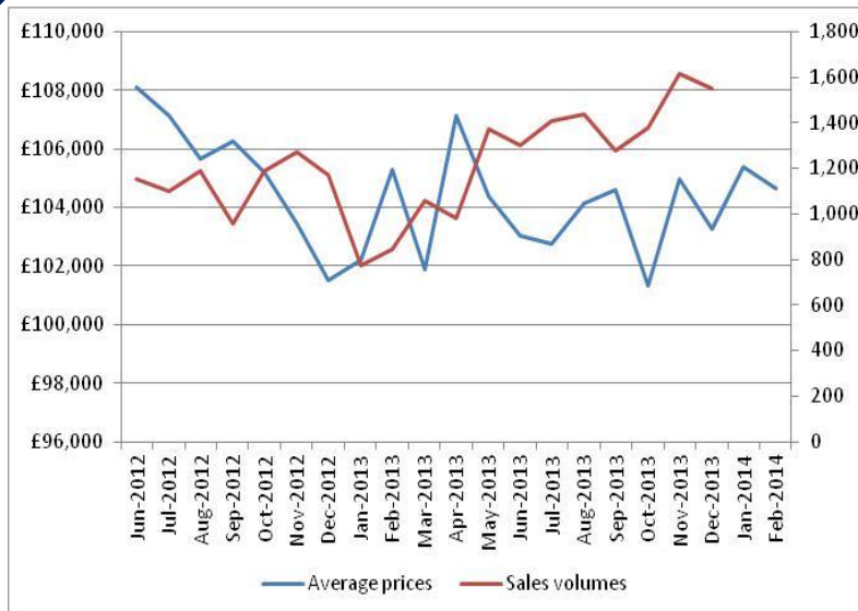
Figure 2: Change in house prices and sales volumes

In 2012/13, Pendle Council made a total of 201 homeless decisions. Of these, 22 applicants were accepted as being homeless and in priority need (10.9%). The number accepted as being homeless equates to 0.58 per 1,000 households in the borough – down from 0.89 in 2011/12 and from 0.92 in 2010/11.