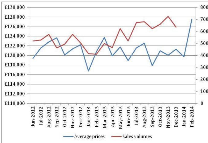
Figure 2: Change in house prices and sales volumes

In 2012/13, Eden Council made a total of 12 homeless decisions. Of these, 2 applicants were accepted as being homeless and in priority need (16.7%). The number accepted as being homeless equates to 0.09 per 1,000 households in the district – down from 0.35 in 2011/12 and in 2010/11.