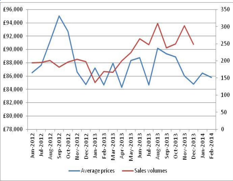
Figure 2: Change in house prices and sales volumes

In 2012/13, Salford Council made a total of 657 homeless decisions. Of these, 279 applicants were accepted as being homeless and in priority need (42.5%). The number accepted as being homeless equates to 2.71 per 1,000 households in the borough – down from 2.87 in 2011/12 but up from 2.50 in 2010/11.