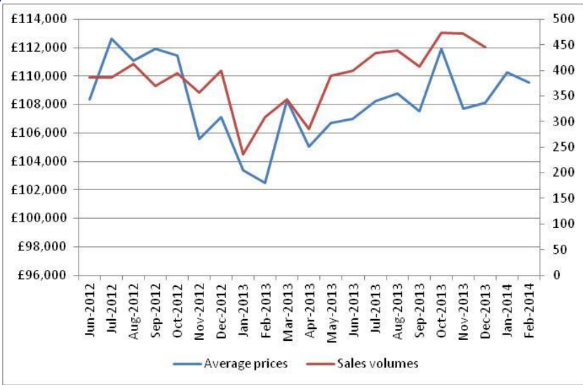
Figure 2: Change in house prices and sales volumes

In 2012/13, Kirklees Council made a total of 646 homeless decisions. Of these, 401 applicants were accepted as being homeless and in priority need (62.1%). The number accepted as being homeless equates to 2.32 per 1,000 households in the borough – up from 1.9 in 2011/12 and down from 2.04 in 2010/11.