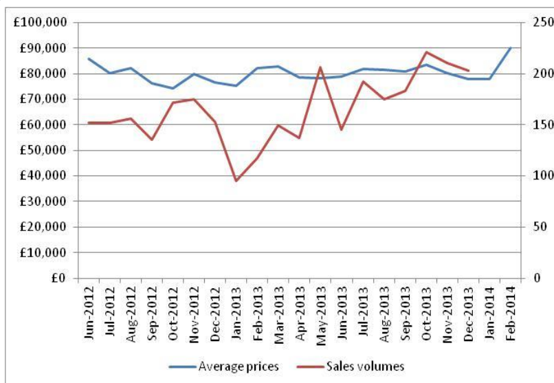
Figure 2: Change in house prices and sales volumes

In 2012/13, North East Lincolnshire Council made a total of 248 homeless decisions. Of these, 174 applicants were accepted as being homeless and in priority need (70.2%). The number accepted as being homeless equates to 2.52 per 1,000 households in the borough – up from 2.28 in 2011/12 but down from 2.79 in 2010/11.