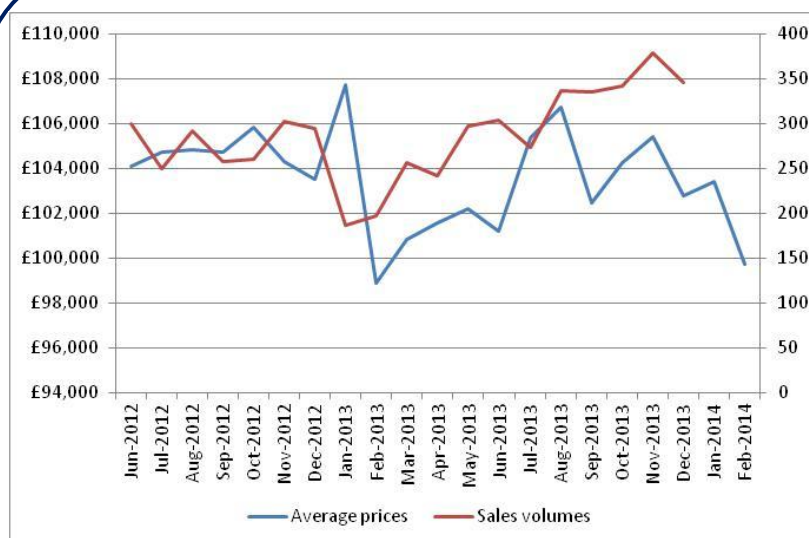
Figure 2: Change in house prices and sales volumes

In 2012/13, Wakefield Council made a total of 626 homeless decisions. Of these, 204 applicants were accepted as being homeless and in priority need (32.6%). The number accepted as being homeless equates to 1.42 per 1,000 households in the borough – up from 1.23 in 2011/12 from 0.94 in 2010/11.