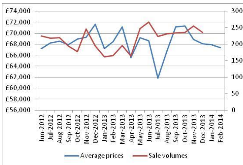
Figure 2: Change in house prices and sales volumes

In 2012/13, Kingston upon Hull Council made a total of 910 homeless decisions. Of these, 567 applicants were accepted as being homeless and in priority need (62.3%). The number accepted as being homeless equates to 4.65 per 1,000 households in the borough – up from 4.57 in 2011/12 and from 4.37 in 2010/11.