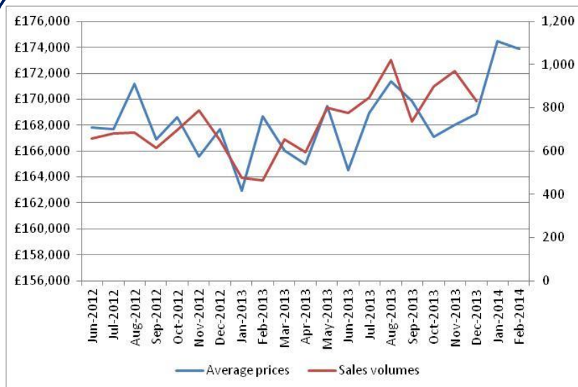
Figure 2: Change in house prices and sales volumes

In 2012/13, Scarborough Council made a total of 230 homeless decisions. Of these, 124 applicants were accepted as being homeless and in priority need (53.9%). The number accepted as being homeless equates to 2.48 per 1,000 households in the district – down from 2.90 in 2011/12 and from 3.00 in 2010/11.