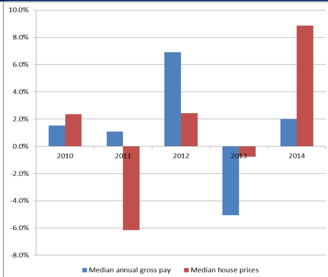
Figure 2: Annual % change in house prices and pay

As figure 2 shows, median house prices and pay have not grown at the same rate. Median house price growth outstripped that of median pay in 2014. As a result, the affordability ratio grew to 6.3 from 5.9 between 2013 and 2014.