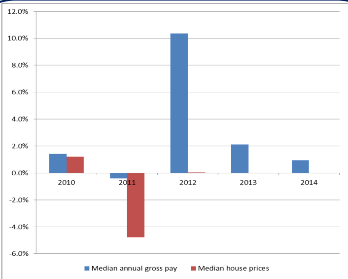
Figure 2: Annual % change in house prices and pay

As figure 2 shows, median house prices and pay have not grown at the same rate. While median pay has continued to grow since 2012, there has been little change in house prices. As a result, the affordability ratio fell to 3.9 from 4.0 between 2013 and 2014.