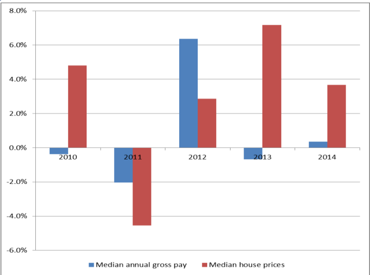
Figure 2: Annual % change in house prices and pay

As figure 2 shows, median house prices and pay have not grown at the same rate. Median gross house prices growth outstripped that of median pay in 2014. As a result, the affordability ratio grew to 5.7 from 5.6 between 2013 and 2014.