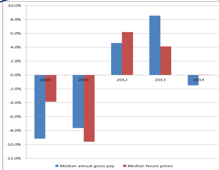
Figure 2: Annual % change in house prices and pay

As figure 2 shows, median house prices and pay have not grown at the same rate. Median gross house prices remained at 2013 levels while median pay fell in 2014. As a result, the affordability ratio grew to 6.8 from 6.7 between 2013 and 2014.