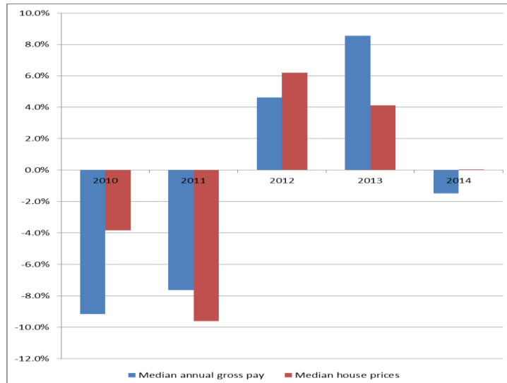
Figure 2: Annual % change in house prices and pay

As figure 2 shows, median house prices and pay have not grown at the same rate. Median gross pay is not available for 2013 but the affordability ratio fell to 6.9 from 7.5 between 2012 and 2014.