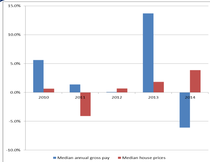
Figure 2: Annual % change in house prices and pay

As figure 2 shows, median house prices and pay have not grown at the same rate. Median gross house prices grew while median pay fell in 2014. As a result, the affordability ratio grew to 6.7 from 6.0 between 2013 and 2014.