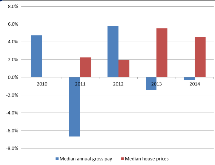
Figure 2: Annual % change in house prices and pay

As figure 2 shows, median house prices and pay have not grown at the same rate. Median house price in 2014 whilst median pay fell. As a result the affordability ratio grew to 6.5 from 6.2 between 2013 and 2014.