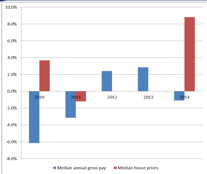
Figure 2: % change in house prices and pay

As figure 2 shows, median house prices and pay have not grown at the same rate. Median house prices grew while median gross pay (ASHE) fell in 2014. As a result, the affordability ratio grew to 6.9 from 6.3 between 2013 and 2014.