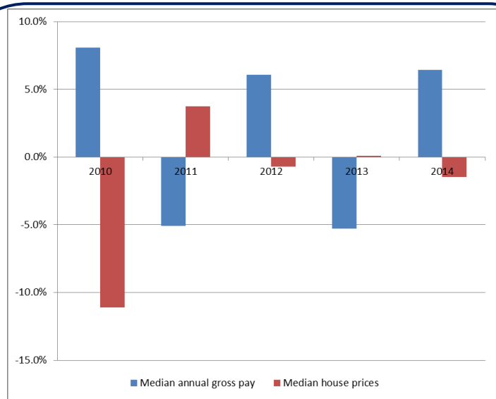
Figure 2: % change in house prices and pay

In 2014/15, there were 185 homeless acceptances by Liverpool Council which is a 20.6% fall on the 233 acceptances in 2009/10. A total of 51 households were found temporary accommodation and there were no households that were not found accommodation at the end of March 2015 despite a duty being owed. In October 2014, the total number of vacant homes was 9,177. This is a 25.9% decrease from 12,392 in 2009 compared with the 20.8% decrease in Merseyside. Long-term vacants fell by 54.1% over the same period. There was a total of 2,333 social vacants and 777 were classed as long-term vacant (33.3%). As at April 2014, there were 13,166 households on the housing waiting list in Liverpool. This is a 12.2% decrease on the previous year 14,989. Furthermore, this figure represented a large fall on previous years and the long-term trend is a 25% decrease on 2009 figures. There are clear signs of a recovery in housing market with year-on-year increases in sales between 2009 and 2014 (85.5%) with greatest increase in sales of semi-detached properties (ONS). The data also shows house prices were down on 2013, however (£121,950). As figure 2 shows, median house prices and pay have not grown at the same rate. Median gross pay grew while median house prices fell in 2014. As a result, the affordability ratio fell to 5.3 from 5.7 between 2013 and 2014.