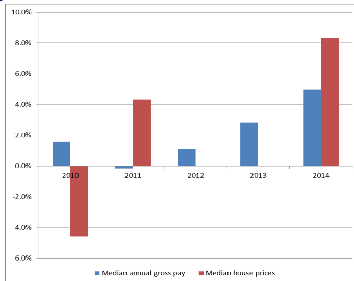
Figure 2: % change in house prices and pay

As figure 2 shows, median house prices and pay have not grown at the same rate. Median house prices outstripped that of median gross pay (ASHE) in 2014. As a result, the affordability ratio grew to 5.5 from 5.3 between 2013 and 2014.