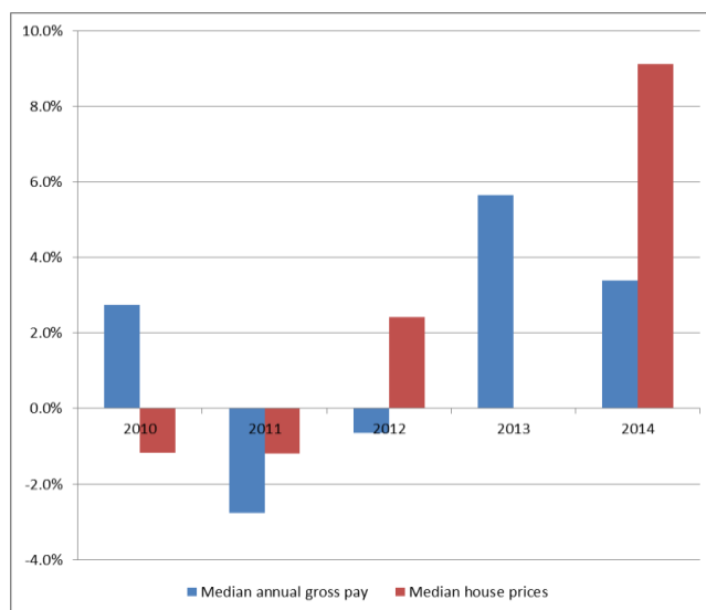
Figure 2: % change in house prices and pay

As figure 2 shows, median house prices and pay have not grown at the same rate. Median house price growth outstripped that of median gross pay (ASHE) in 2014. As a result, the affordability ratio grew to 4.7 from 4.4 between 2013 and 2014.