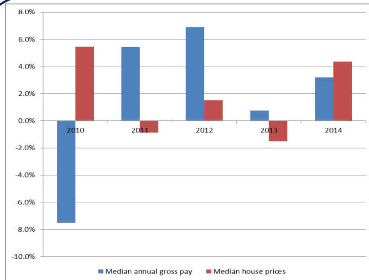
Figure 2: % change in house prices and pay

As figure 2 shows, median house prices and pay have not grown at the same rate. Median house prices fell in 2013 while median gross pay (ASHE) grew. As a result, the affordability ratio fell to 6.0 from 6.1 between 2012 and 2014.