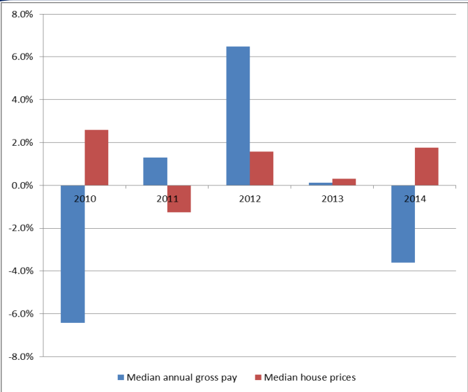
Figure 2: % change in house prices and pay

As figure 2 shows, median house prices and pay have not grown at the same rate. Median house prices grew while median gross pay fell (ASHE) in 2014. As a result, the affordability ratio grew to 7.4 from 7.0 between 2013 and 2014.