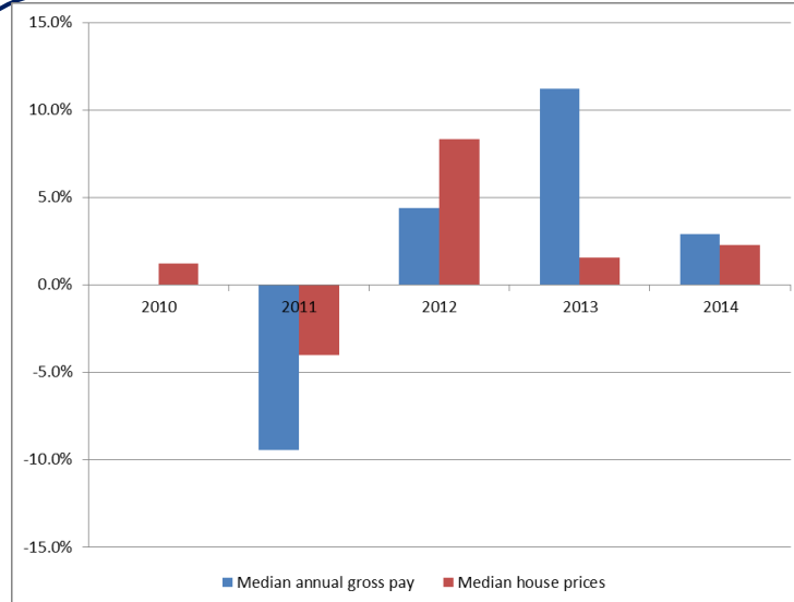
Figure 2: % change in house prices and pay

As figure 2 shows, median house prices and pay have not grown at the same rate. Median gross pay growth outstripped that of median house prices in 2013. As a result, the affordability ratio fell to 6.6 from 7.3 between 2012 and 2013.