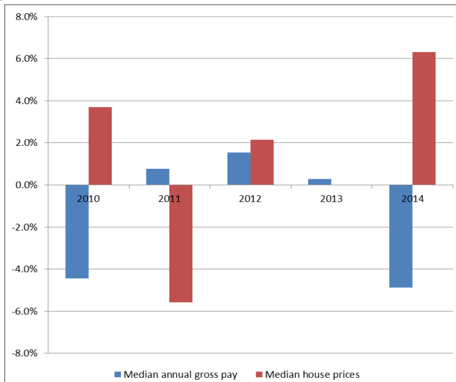
Figure 2: Annual % change in house prices and pay

As figure 2 shows, median house prices and pay have not grown at the same rate. Median house prices grew while median pay fell in 2014. As a result, the affordability ratio grew to 5.9 from 5.3 between 2013 and 2014.