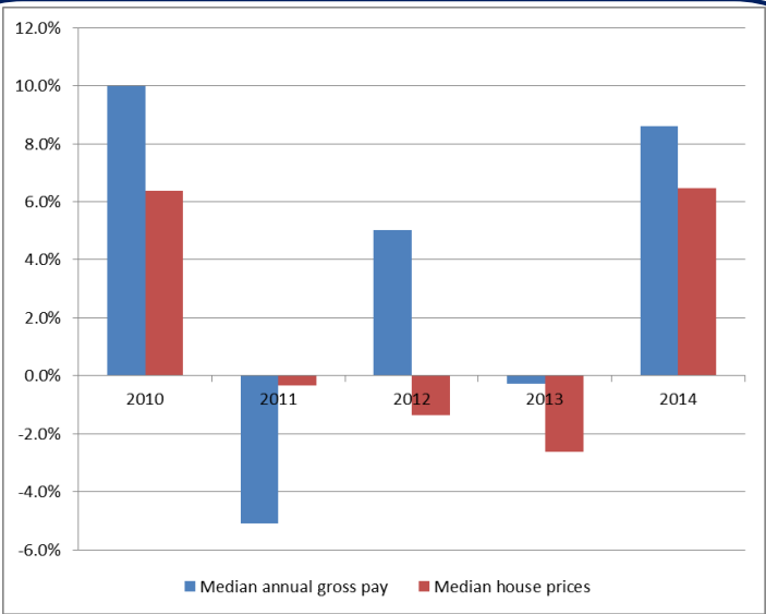
Figure 2: Annual % change in house prices and pay