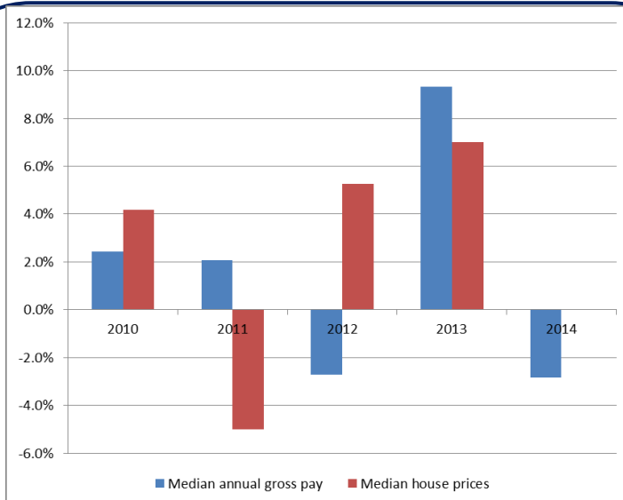
Figure 2: Annual % change in house prices and pay

As figure 2 shows, median house prices and pay have not grown at the same rate. Median pay fell in 2014 while median house prices remained constant from 2013. As a result, the affordability ratio grew to 5.8 from 5.6 between 2013 and 2014.