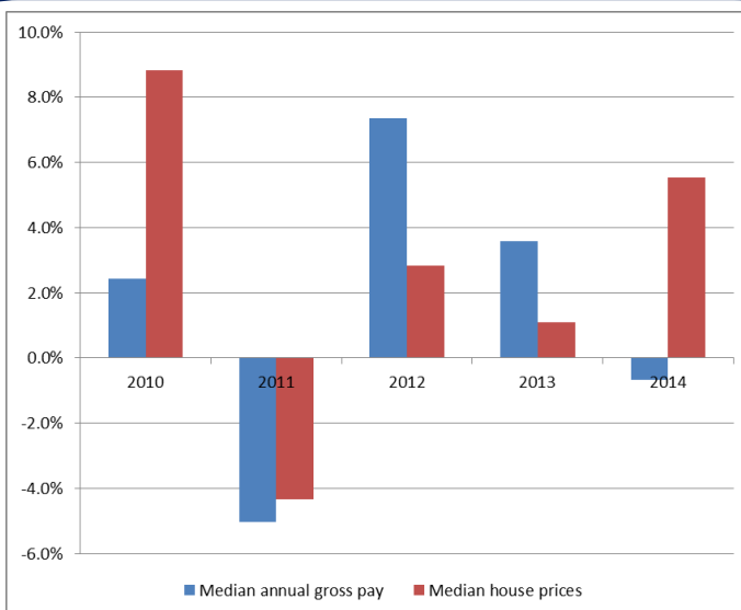
Figure 2: Annual % change in house prices and pay

As figure 2 shows, median house prices and pay have not grown at the same rate. Median pay fell in 2014 while median house prices grew. As a result, the affordability ratio grew to 5.5 from 5.2 between 2013 and 2014.