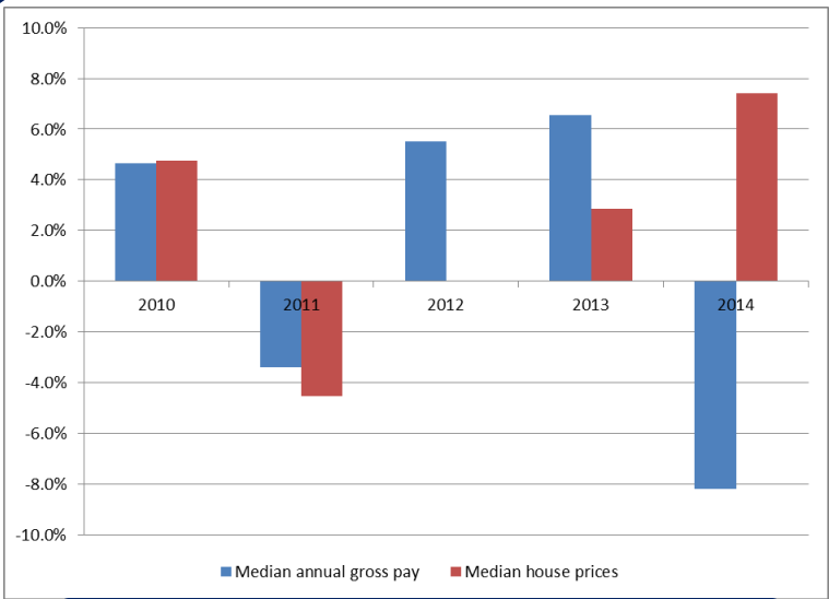
Figure 2: Annual % change in house prices and pay

As figure 2 shows, median house prices and pay (ASHE) have not grown at the same rate. Although median pay growth outstripped that of house prices from 2011 to 2013, this pattern was reversed in 2014. As a result, the affordability ratio grew to 5.9 from 5.0 between 2013 and 2014.