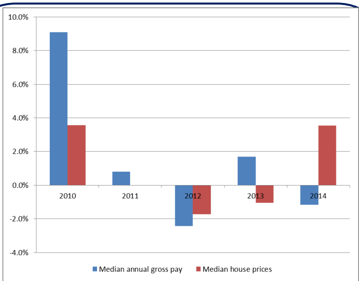
Figure 2: Annual % change in house prices and pay

As figure 2 shows, median house prices and pay have not grown at the same rate. Although house prices fell in 2012 and 2013, they recovered in 2014 while pay fell (ASHE). As a result, the affordability ratio increased between increased to 7.9 from 7.5 between 2013 and 2014.