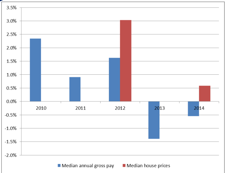
Figure 2: Annual % change in house prices and pay

As figure 2 shows, median house prices and pay have not grown at the same rate. Median pay (ASHE) fell in both 2013 and 2014 while house prices grew in 2014. As a result, the affordability ratio increased between increased to 7.8 from 7.7 between 2013 and 2014.