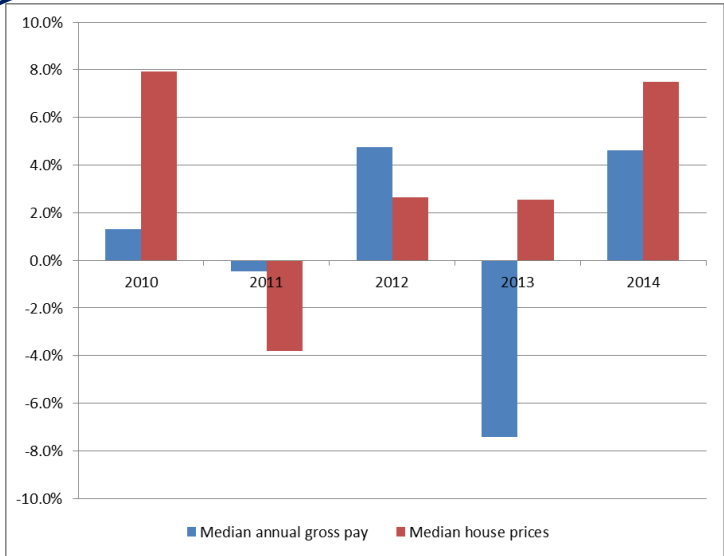
Figure 2: Annual % change in house prices and pay

In 2014/15, there were 103 homeless acceptances by York Council. This is a 20.8% decrease on the 130 acceptances in 2009/10. Of these, 65 households were found temporary accommodation and there were no cases of a duty being owed but no accommodation found. In October 2014, the total number of vacant homes was 847. This is a 43.2% decrease from 1,491 in 2009 compared with the 9.9% fall in North Yorkshire. Long-term vacants fell by over a fifth (51.7%) over the same period. There was a total of 60 social housing vacants and 5 were classed as long-term vacant (8.3%) which is an increase from 6 in the previous year. As at April 2014, there were 1,805 households on the housing waiting list in York. This is a 51.7% decrease on the previous year of 3,739. Furthermore, this figure represented a large fall on previous years and the long-term trend is a 22.2% fall on 2009 figures. There are clear signs of a recovery in housing market in the constituency with an overall increase in sales between 2009 and 2014 (43.5%) with greatest increase in sales of flats and maisonettes (ONS). The data also shows house prices being at their highest level in 2004 (£215,000). As figure 2 shows, median house prices and pay have not grown at the same rate. Median house prices outstripped median pay in 2014. As a result, the affordability ratio increased between increased to 10.1 from 9.9 between 2013 and 2014.