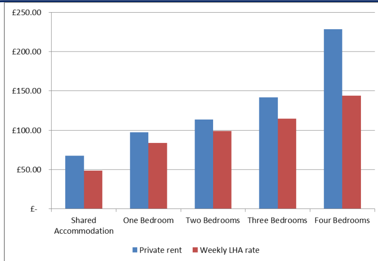
Figure 1: Private rent and LHA rate

It is estimated that the cost of removing these category 1 hazards from private sector properties would run to £25m. In 2013/14, 89 private properties were made free of category 1 hazards as a direct result of Bolton Council.