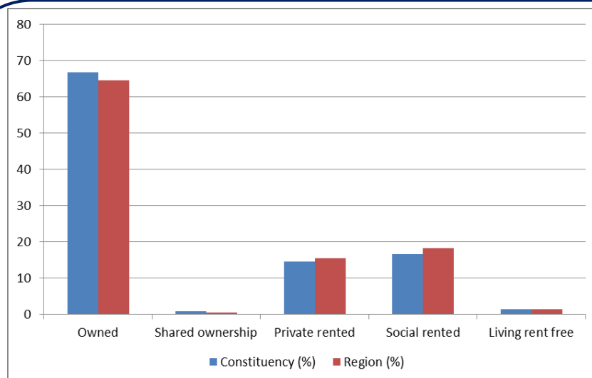
Figure 1: Housing Tenure in constituency

In the second quarter of 2017, median house prices in the constituency stood at £123,000. With median annual salaries at £22,880, the median affordability ratio is 5.4 in the constituency compared to a regional ratio of 5.7.