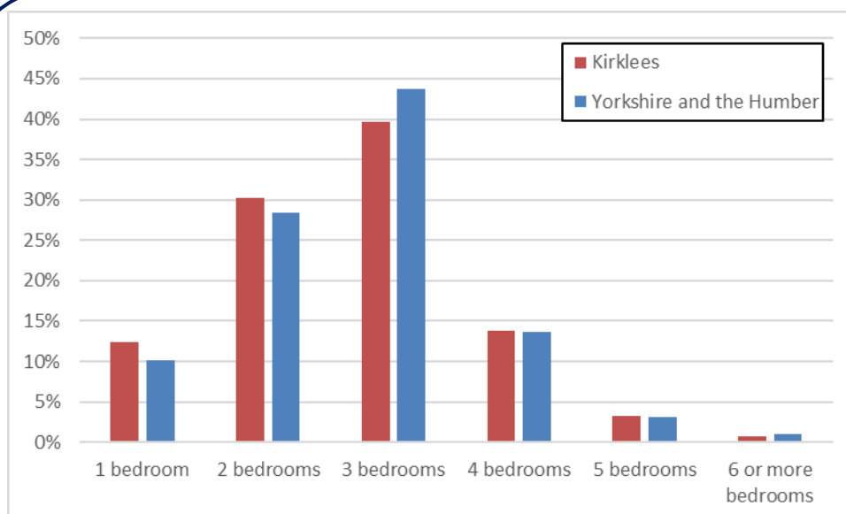
Figure 1: Number of bedrooms

At the regional level there are 32,404 households subject to the Spare Room Reduction (9.9% of all Housing Benefit claimants). However, these data appear to show a better balance between household size and the size/type of dwellings available in the district than other parts of the sub-region.