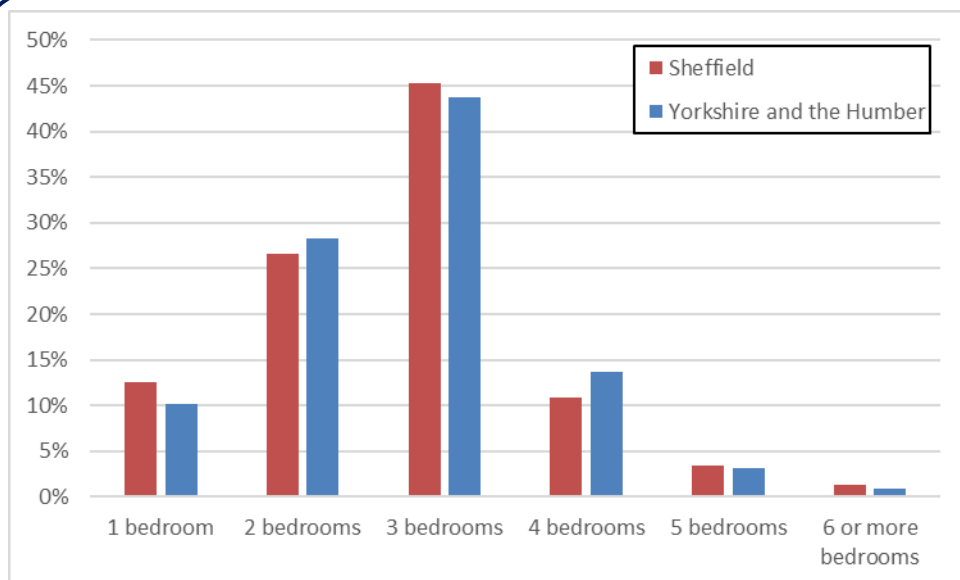
Figure 1: Number of bedrooms

At the regional level there are 32,404 households subject to the Spare Room Reduction (9.9% of all Housing Benefit claimants). However, these data appear to show a better balance between household size and the size/type of dwellings available in the district than other parts of the sub-region.