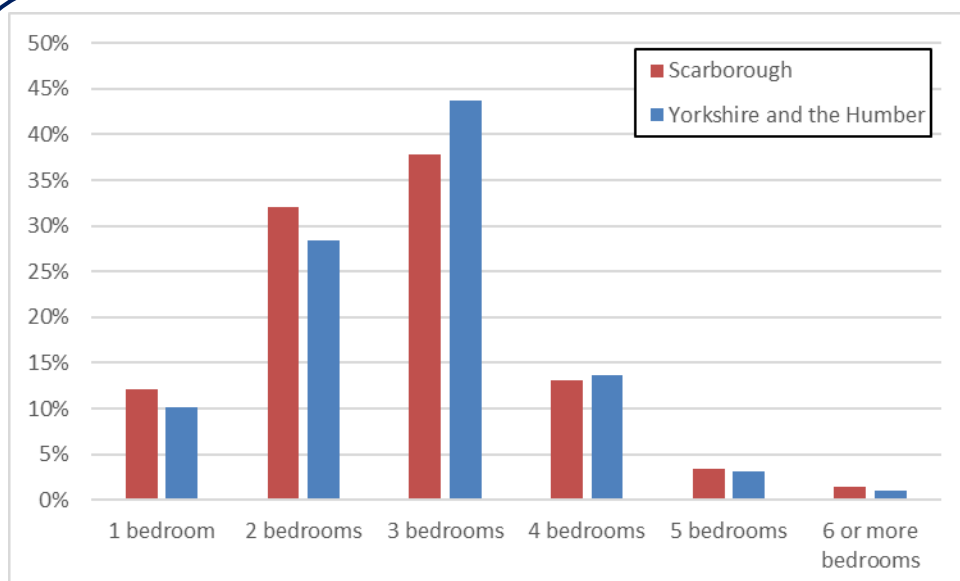
Figure 1: Number of bedrooms

At the regional level there are 32,404 households subject to the Spare Room Reduction (9.9% of all Housing Benefit claimants). However, these data appear to show a better balance between household size and the size/type of dwellings available in the district than other parts of the sub-region.