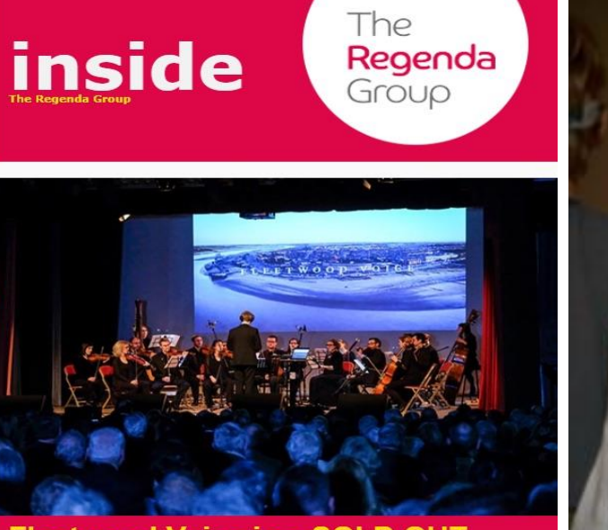
Fleetwood Voice is a SOLD OUT success